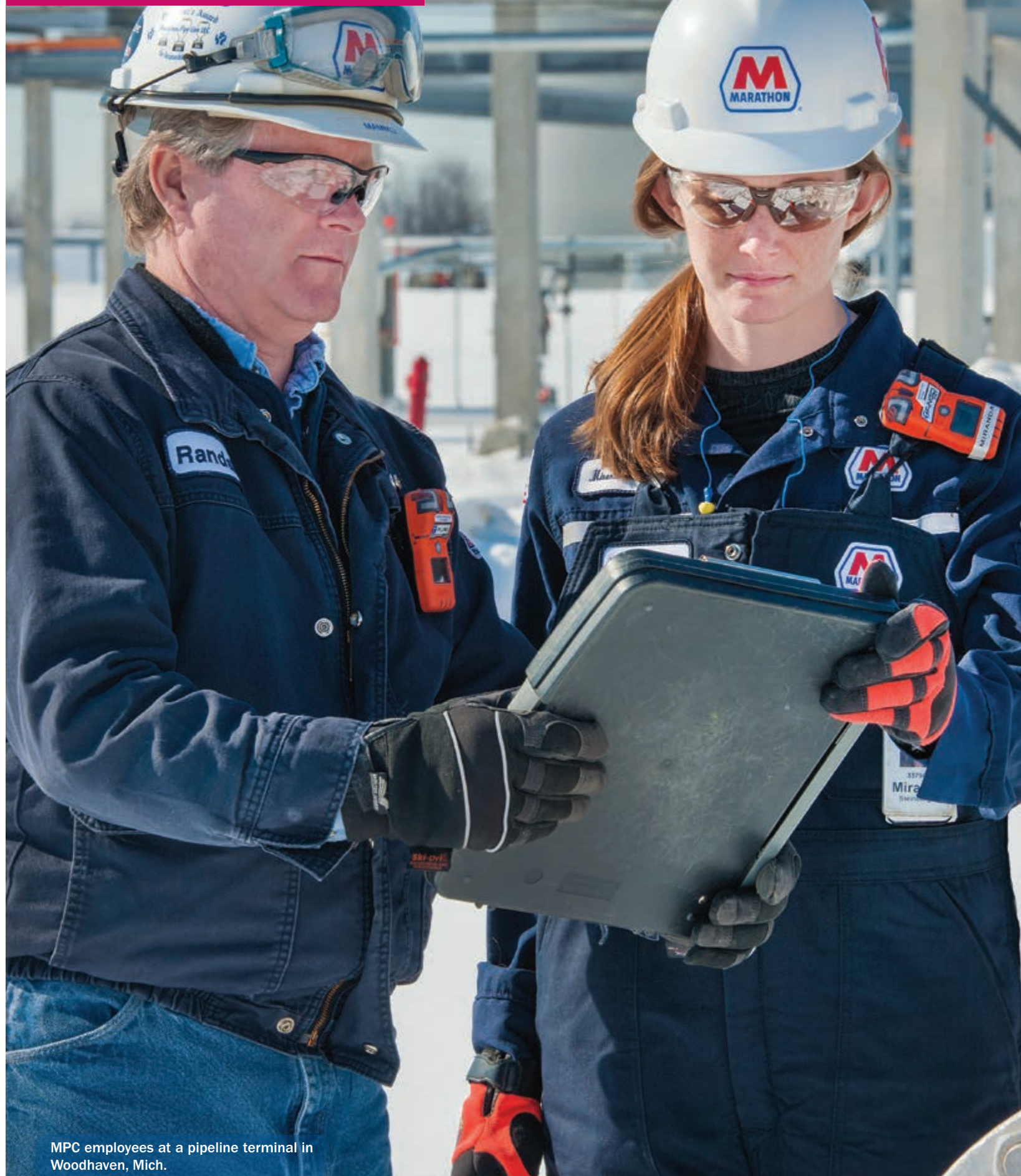
MPC employees at a pipeline terminal in Woodhaven, Mich.