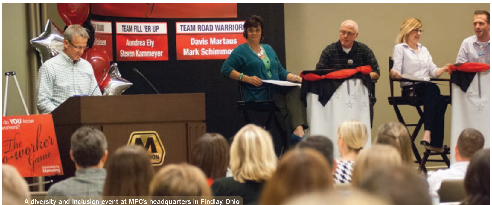
A diversity and inclusion event at MPC's headquarters in Findlay, Ohio